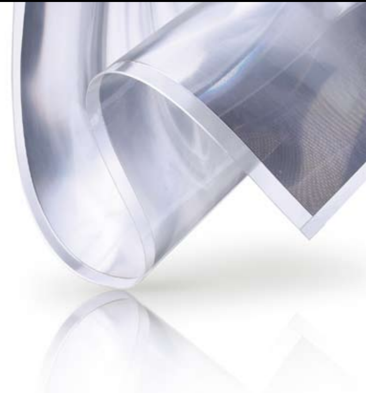
Free Form Lenses